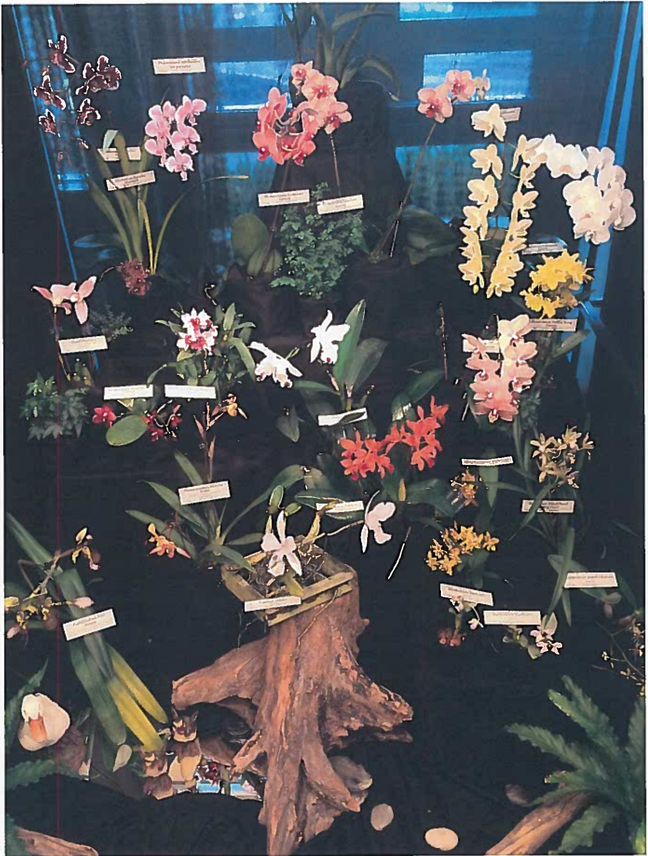
The West Shore display at the Central Ohio Orchid Society Show at Franklin Park in Columbus.